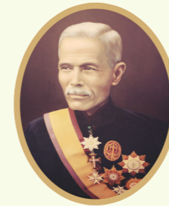
何東爵士 Sir Robert Ho Tung