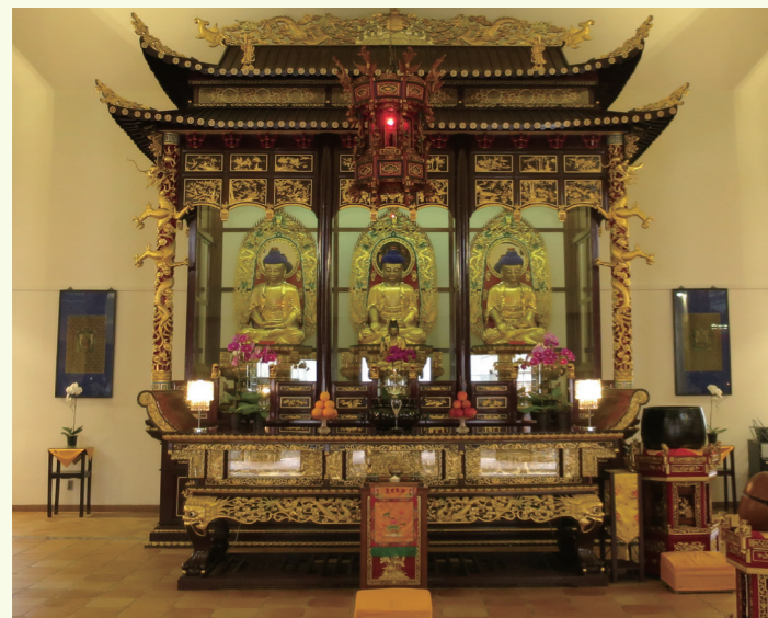
大雄寶殿內景 Worship Hall interior