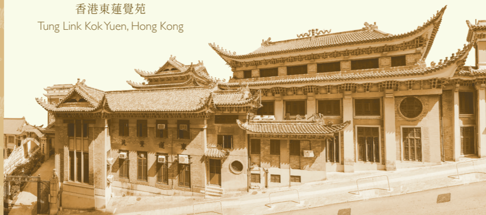
香港東蓮覺苑 Tung Lin Kok Yuen, Hong Kong